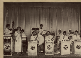
The band "Silver Sisters" (around 1950)