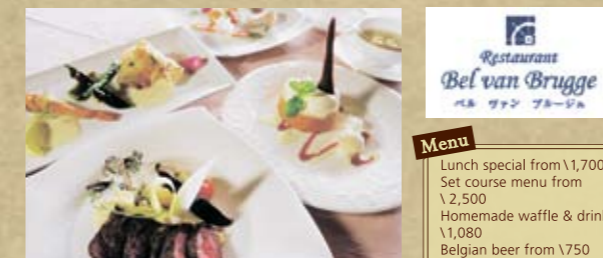
Set course menu