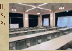
"Momoyama" in seminar style

Note: Reservations are accepted four months in advance. For details, please contact Biwako Otsukan.