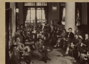
In the small restaurant (around 1950)