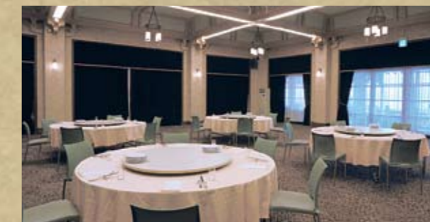
"Momoyama" in banquet style