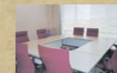
Small conference room

The "Momoyama" multi-purpose hall, along with 14 small conference rooms, is available for hire as a venue for events, banquets and seminars.