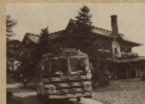
Bus with English displays (1957)