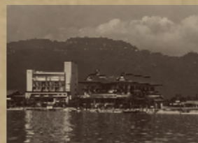
View of the hotel from Lake Biwa (1962)