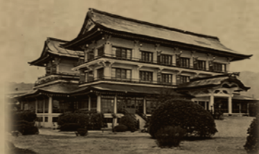
Exterior of the former Biwako Hotel (around 1960)

Designated as a Tangible Cultural Property by Otsu City (2000)