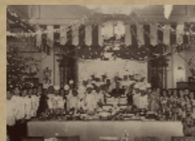
Christmas party (around 1950)