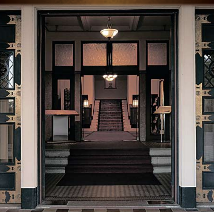
Shiga "lake region" guesthouse on Lake Biwa