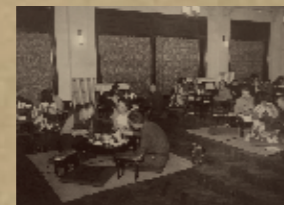
Weekly "sukiyaki party" on Saturdays (around 1950)